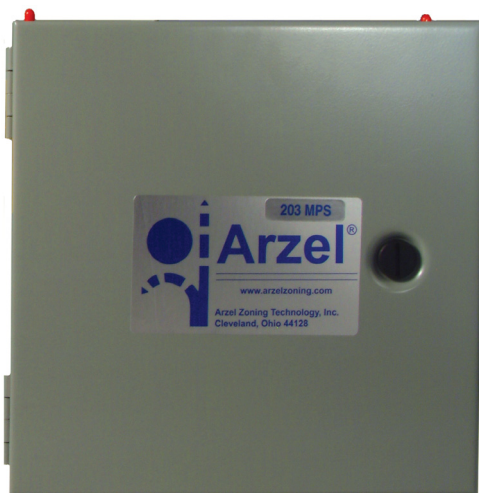
200 MPS ® Panel